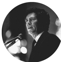
Sen. Gary Hart